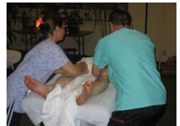
Students practicing massage techniques in class.

with some CEU workshops for massage professionals. See the schedule on the next page, then check our website for future offerings. You can register by phone, in person, or on-line.